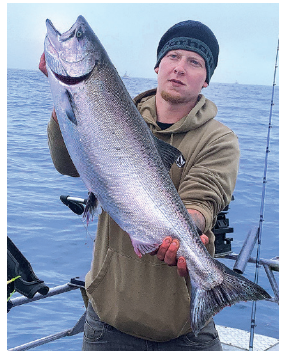
Bodega Bay was the scene of great summer salmon action for the Fish Sniffer staff.

Within five minutes of lines CONTINUED ON PG 12