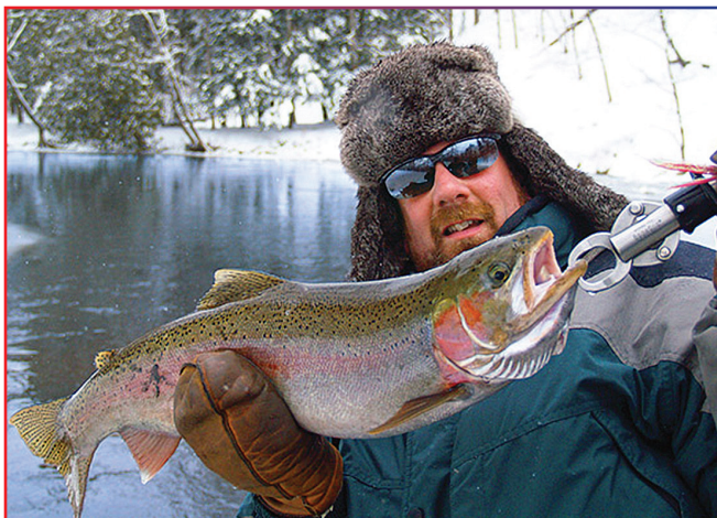
Steelhead like this beautiful fish are widely regarded as the hardest fighting fish in fresh water.

And it's the finesse needed to fool these fish followed by the manic mayhem once