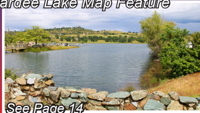
See Page 14