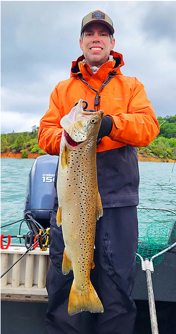
The author shows off a massive brown trout that was caught and released while pre-fishing the Shasta Classic Tourney on May 5. The fish slammed a Speedy Shiner trolled at 2.7 miles-per-hour across a gradual point on the main lake at only nine feet deep.