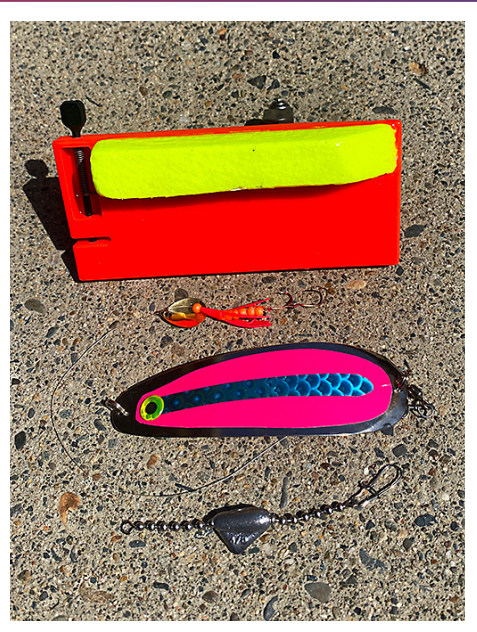
During the Kokanee Power derby on April 1, the author deployed sideplaners to bag Bullards Bar kokanee up to 12.5-inches in length. Top: This Church Tackle TX-6 side planer was modified by epoxying a strip of Styrofoam at the top to keep it from sinking. At the bottom is one of many keel sinkers of various sizes the author clipped 24-inches above his dodger. He tried different weights until he found the kokanee zone!

event. He was already on the water, so I made my way down with tackle bags and rods slung in every direction.